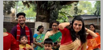
Highlight 2: Rongali Bihu Celebration

The vibrant festival of Rongali Bihu was celebrated with great enthusiasm at Projonmo, a center dedicated to children with special needs. The celebration brought joy and a sense of cultural unity among the children, their families, and the staff. Traditional Bihu songs and dances enlivened the atmosphere, with the children participating in various activities tailored to their abilities and interests. The event was not just a celebration of Assamese culture, but also a testament to the inclusivity and support that Projonmo strives to provide. The smiles on the children's faces and the shared moments of happiness highlighted the essence of community and the spirit of Rongali Bihu, making the day a memorable one for everyone involved.