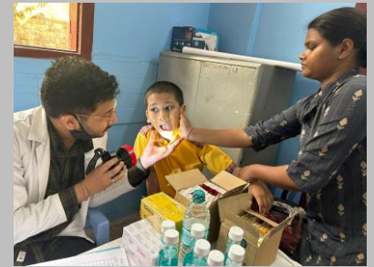
Highlight 4: World Health Day Celebration