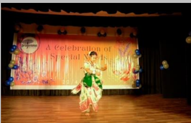
Highlight 3: Autism Month Celebration