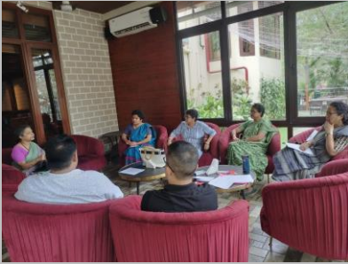
Highlight 1: Annual General Meeting

Annual General Meeting, a vital moment where we the board members have united and the event brought us together to share ideas and propel our organization forward for the betterment of our community exchange ideas and advance our organization, thereby benefiting the community. During this gathering, we reviewed the past year, planned for the future, and charted our course ahead.